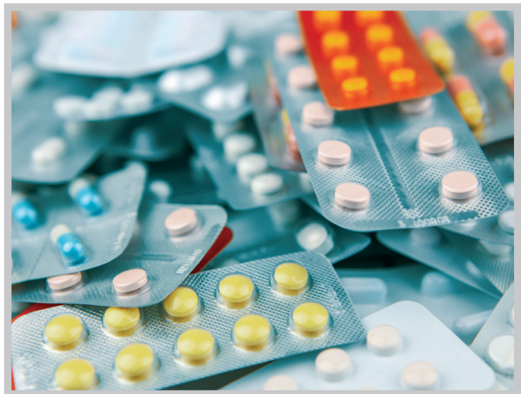
Under PDPM, providers will need to get a firm understanding of their medication charges.

establishing a robust disease-management program, such as one that aims to better control residents’ diabetes and reduce the number of insulin doses delivered by staff daily.